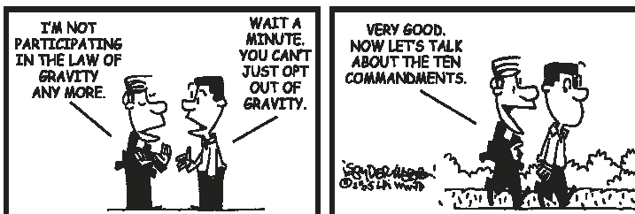
14TH SUNDAY IN ORDINARY TIME