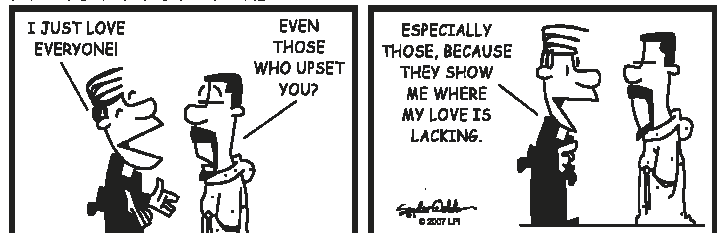
7TH SUNDAY IN ORDINARY TIME

He did it by recognizing that this was, singularly, the most important challenge of his life and mission, and, under the weight of that imperative, by falling on his knees to ask for the help of the One who can do in us what we can't do for ourselves.