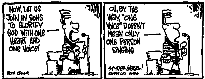
2 ND SUNDAY OF ADVENT

10. The Gospel offers us the chance to live life on a higher plane, but with no less intensity: "Life grows by being given away, and it weakens in isolation and comfort. Indeed, those who enjoy life most are those who leave security on the shore and become excited by the mission of communicating life to others". When the Church summons Christians to take up the task of evangelization, she is simply pointing to the source of authentic personal fulfillment. For "here we discover a profound law of reality: that life is attained and matures in the measure that it is offered up in order to give life to others. This is certainly what mission means". Consequently, an evangelizer must never look like someone who has just come back from a funeral! Let us recover and deepen our enthusiasm, that "delightful and comforting joy of evangelizing, even when it is in tears that we must sow... And may the world of our time, which is searching, sometimes with anguish, sometimes with hope, be enabled to receive the good news not from evangelizers who are dejected, discouraged, impatient or anxious, but from ministers of the Gospel whose lives glow with fervor, who have first received the joy of Christ".