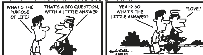
18TH ORDINARY SUNDAY / WHAT MAKES LIFE MEANINGFUL?

The resources on Vibrant Faith @ Home are free, but you must register and login to download the activities. More than 60 faith activities are published each season - spring, summer, fall, and winter.