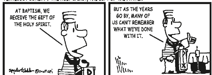
PENTECOST SUNDAY / THE HOLY SPIRIT, THE GIFT OF THE FATHER

WHERE DID YOU SHARE YOUR FAITH THIS WEEK?