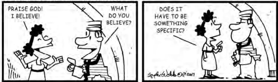
1ST SUNDAY OF LENT / THE PROFESSION OF FAITH

Did You Know about Vatican II... The purpose of Vatican II, according to Pope John, was to open the windows of the Church and let in some fresh air!