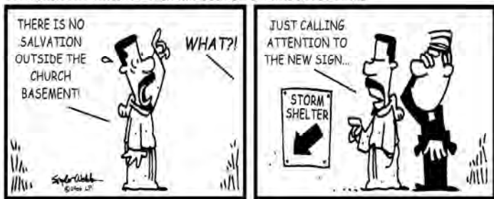
26TH ORDINARY SUNDAY / OPEN-MINDED RESPECT AND LOVE FOR ALL

IN TODAY'S GOSPEL , the disciples were scandalized by an outsider curing in Jesus' name. To the Jew of Jesus' time, a name revealed the power and purpose of the person; to invoke the name of Jesus meant to tap into his healing power. But use of the name had a price; to use a name meant the one invoking it had a relationship to the person, the power, and the movement the name represented. On these grounds, John objects to the outsider healing in Jesus' name. John's question seems to say: "How dare he! This outsider should be one of us!"