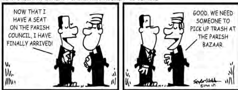
25TH ORDINARY SUNDAY / CHURCH MANAGEMENT IS SERVICE

MARRIAGE PREPARATION FOR ENGAGED COUPLES continues on Thursdays at 7:00pm. Please contact the Parish Office to register.